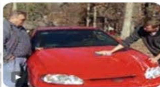
YouTube Sex with a Car | My Strang...

Ford Focus 1-1-1-1-150! Maserati. Bugatti. Driving 80 miles per hour, down the freeway! Everybody needs to be in a car. To drive themselves to the nearest bar. By themselves. With themselves. In one of daddy's prizes possessions.